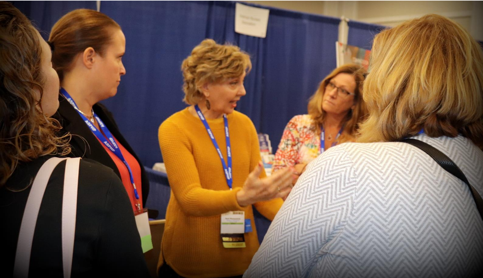
EXHIBIT HALL HOURS - Tentative schedule of events

Engage with prospective customers by partnering with ASPHP in this state-of-the-art event and ensure your products and services will be noticed by our involved audience of safe patient handling professionals. In addition to sound and practical presentations, attendees will participate in up to five hours of structured, case-based, hands-on connectivity with you and your equipment in the Exhibit Hall! We offer a variety of sales packages designed to suit your specific needs. ASPHP can help you achieve your goals with packages to fit any budget.