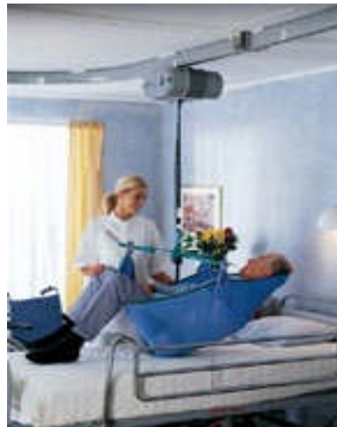
The BRAVO Ceiling-Mounted Lift

“Safe Patient Handling and Movement” is a safer way to help you move and transfer. It is part of a new “No Lift” approach that puts safety first. The nursing and therapy staff will be using special kinds of equipment. This equipment is made just for moving and transferring patients safely and comfortably.