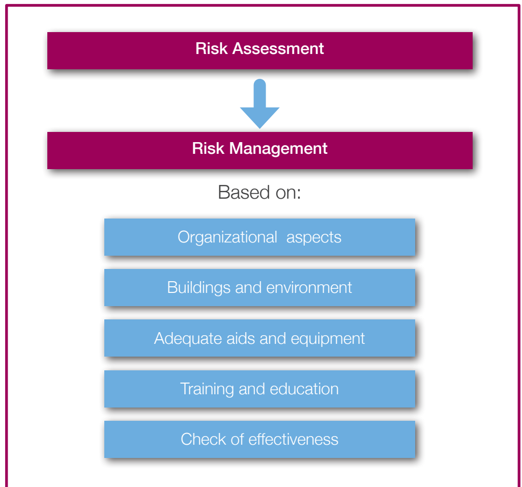
Figure 1 – Comprehensive strategy

Risk assessment is one of the pillars of preventive strategies. A systematic strategy for risk assessment and management must be comprehensive to be successful.